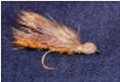
Bullet Head Golden Stone $2.00

I've captured a few of my favorite Stonefly patterns in the following selection. There are many other variations and if you don't see the pattern you're looking for, please ask. I'm sure I can tie it.