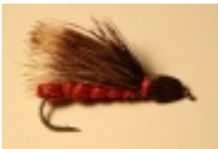
Bullet Head Salmon Fly $2.00