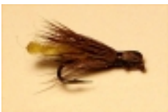
Bullethead Little Yellow Stone $2.00