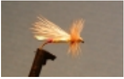
Midge Little Yellow Stone $2.00