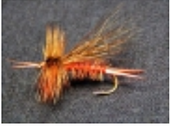
Salmon Fly $2.25