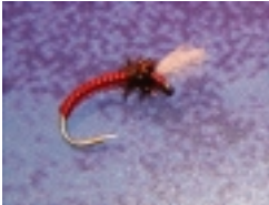
Davis Lake Blood Midge