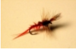
Davis Lake Blood Midge