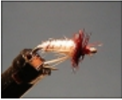
Cream Midge Pupa