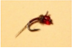
WD-40 Midge-Glass Bead $1.90