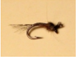
WD-40 Midge $1.90