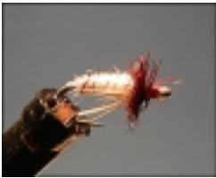
Cream Midge Pupa