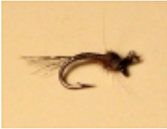
WD-40 Midge $1.90