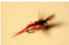
Davis Lake Blood Midge