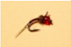
WD-40 Midge-Glass Bead $1.90