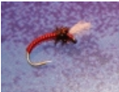
Davis Lake Blood Midge